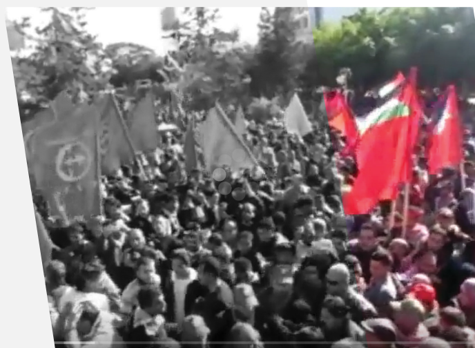
A march of the Popular Front for the Liberation of Palestine, 2012